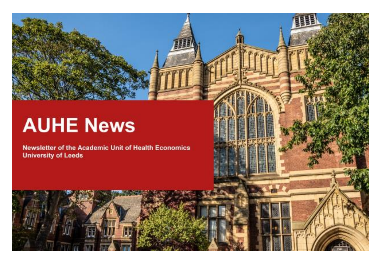
Issue 23: July 2022