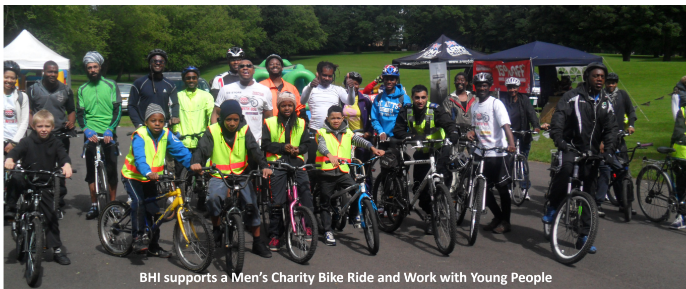
BHI supports a Men's Charity Bike Ride and Work with Young People