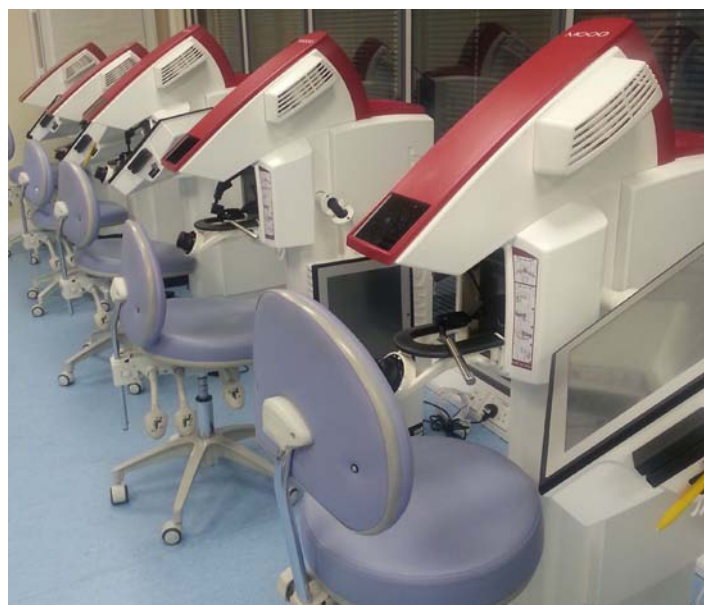
Simodont virtual reality system