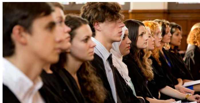
Students at Ceremony

This marks the third year in which this special ceremony has taken place, highlighting the importance that the University, Medical School, Staff and Students all place on professionalism as one of the critical attributes of students and doctors.