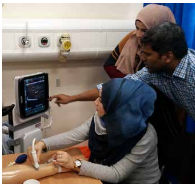
5th year MBChB students attending the vascular access course.

"In line with several medical schools in the USA who have already taken this step, Leeds hopes to be a lead innovator in the use of ultrasound in medical education in the UK."